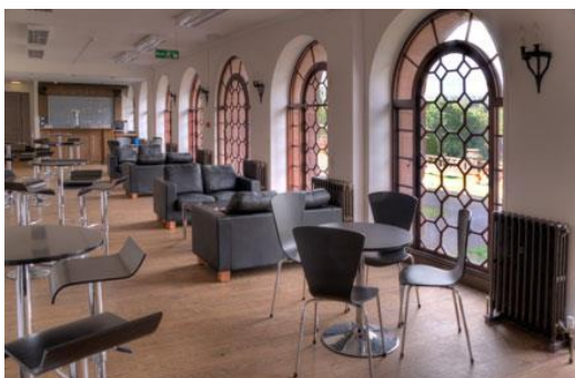
Adult Bar 'The Orangery'