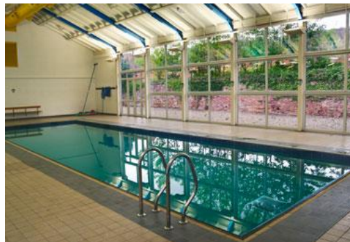
Indoor swimming pool