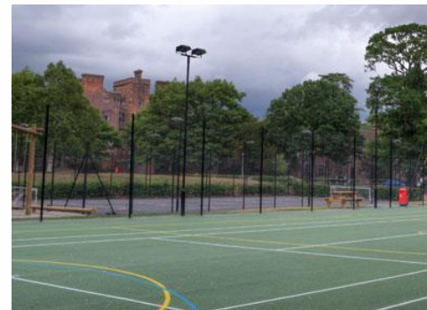
All weather sports pitches