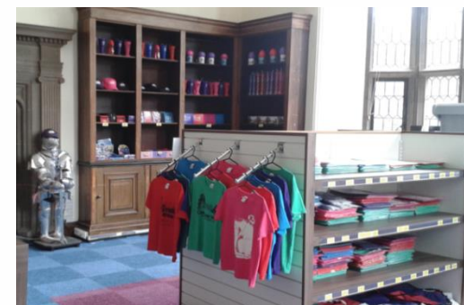
Tuck shop/gift shop