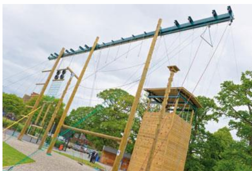
High rope course