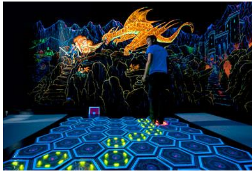
Grid of Stones